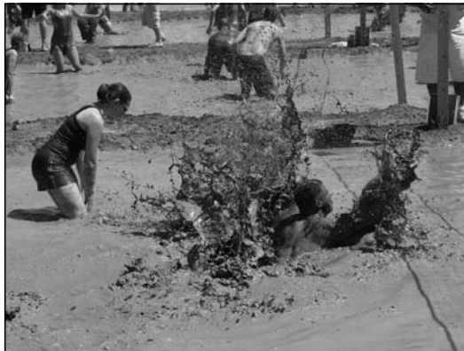
Vital Statistics: Over 7,000 participants in 558 Teams, playing on 93 Courts ... raising over $412,000.

Carrie Tingley Hospital Foundation thanks all the participants, the volunteers, and the 2009 Sponsors: AUI, Inc, First Community Bank, Express Scripts, Bernalillo County, Crystal Springs Bottled Water, Premier Distributing (Budweiser), Clear